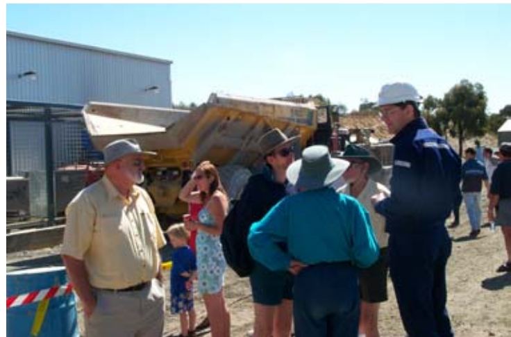
Bendigo Mining staff were available on the day to answer any queries and to offer information on the Bendigo Mining project.