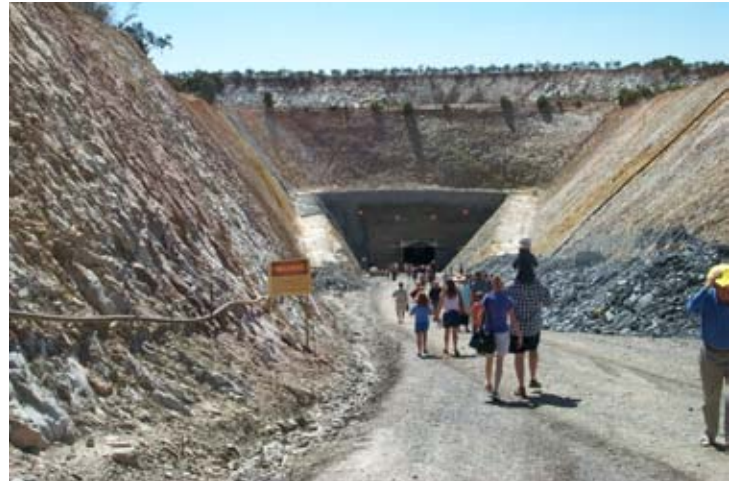
Members of the community taking advantage of the opportunity to check out the entrance to the Swan Decline.

Work on the project is conducted 24hrs, 7 days a week.