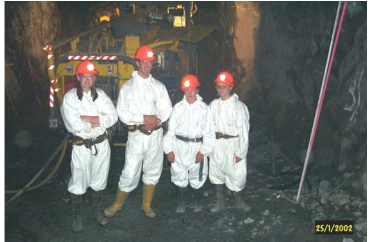
Students underground in the Swan Decline, approximately 550 metres below the city of Bendigo.