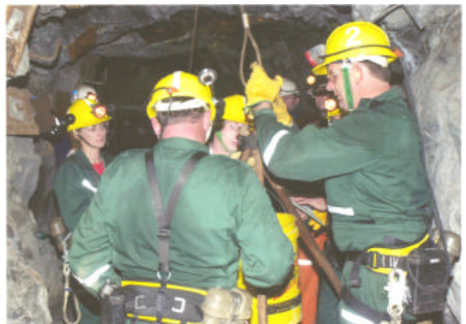
The team go through their paces underground at the Central Deborah. 7-8-00

During August the National Mines Rescue Competition was held in Bendigo. Teams from all over Australia competed at 3 sites: Central Deborah Gold Mine, Bendigo Mining's New Moon Sampling Plant and at the CFA training ground at Huntly. Bendigo's team, Oscar 1, won the Safety Assessment Award section of the competition and the trophy is proudly displayed at the Bendigo Mining site office.